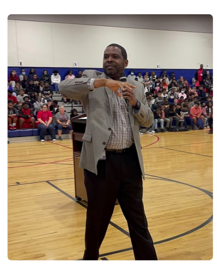
Black History Month Assembly