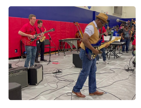
Black History Month Assembly