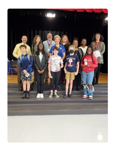
Superintendent's Lunch Tasting Tour