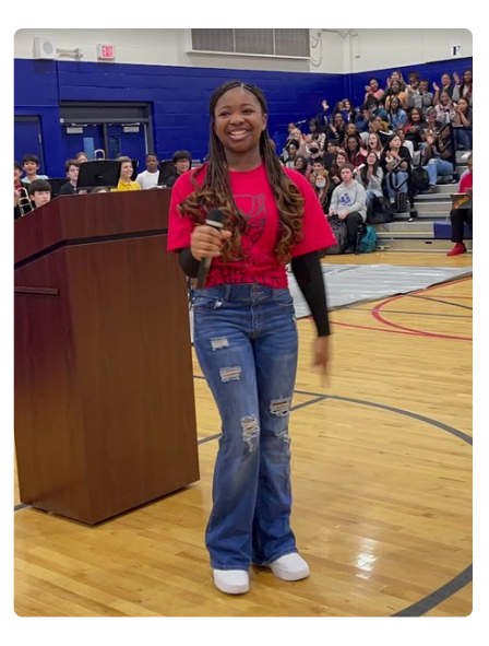
We Love our Teachers a Waffle Lot!