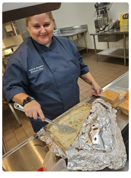
Superintendent's Lunch Tasting Tour